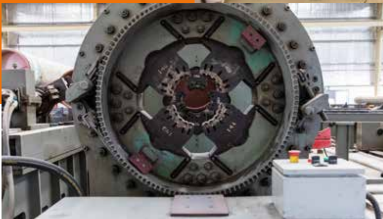
Make-up Unit with automatic torque