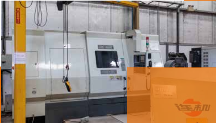
CNC Machines for Coupling